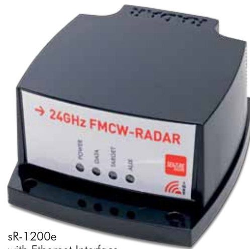
sR-1200e with Ethernet Interface